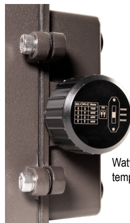
Wattage and color temp. controls.