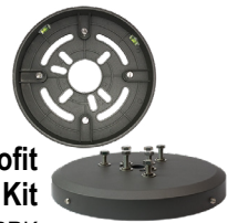
Universal Retrofit Base Kit Part Number: BRK